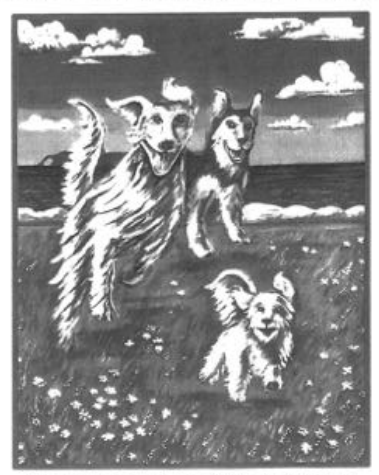
Oxnard Beach Park - 1601 Harbor Blvd January 20, 2018 10:00 AM -3:00 PM (RAIN DATE JAN 27TH) www.OxnardBeachDogPark.org

Booths for Pet Products & Services Dog Trainers Pet Health Info Rescue and Adoptions